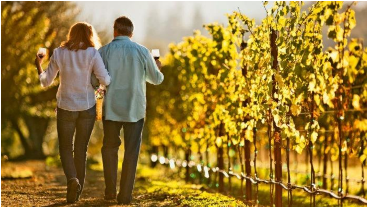
Domaine de la Mordorée – Visit the Vineyard and Wine Tasting

With a history of over 2,000 years, the village of Alba la Romaine is an idyllic hamlet built around a basalt peak, a castle, and a volcanic peak. The village is surrounded by numerous vineyards. You can discover that the 15th-century ramparts in this medieval village are majestic. The village is clad in white limestone and black basalt, giving it a unique gothic atmosphere.