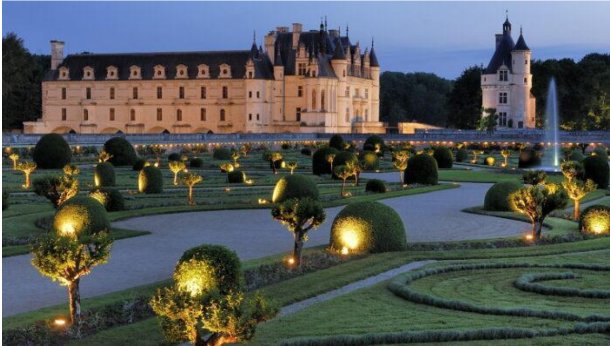
Hotel: Le Clos d'Amboise