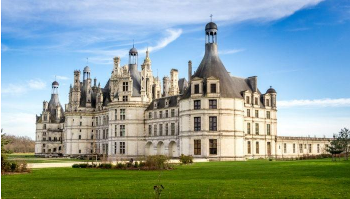
Hotel: Le Clos d'Amboise