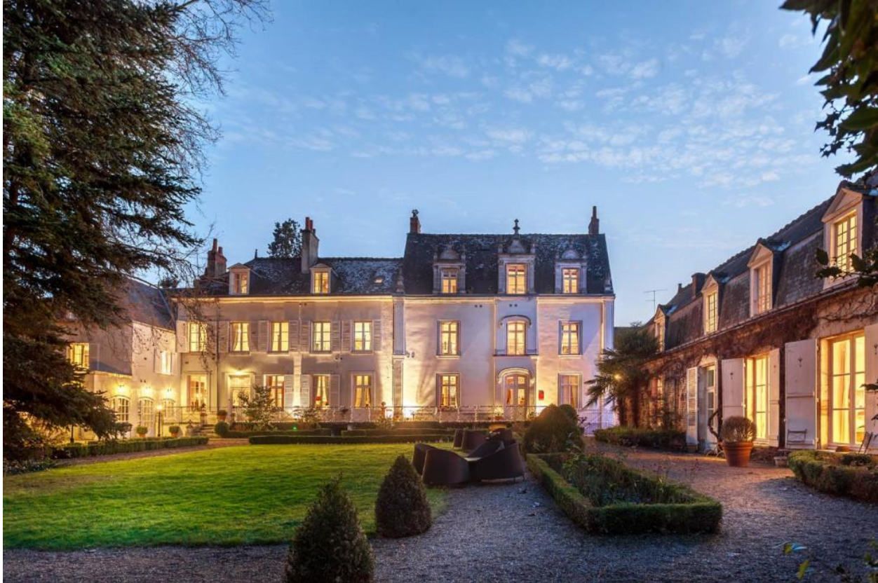
Hotel: Le Clos d'Amboise