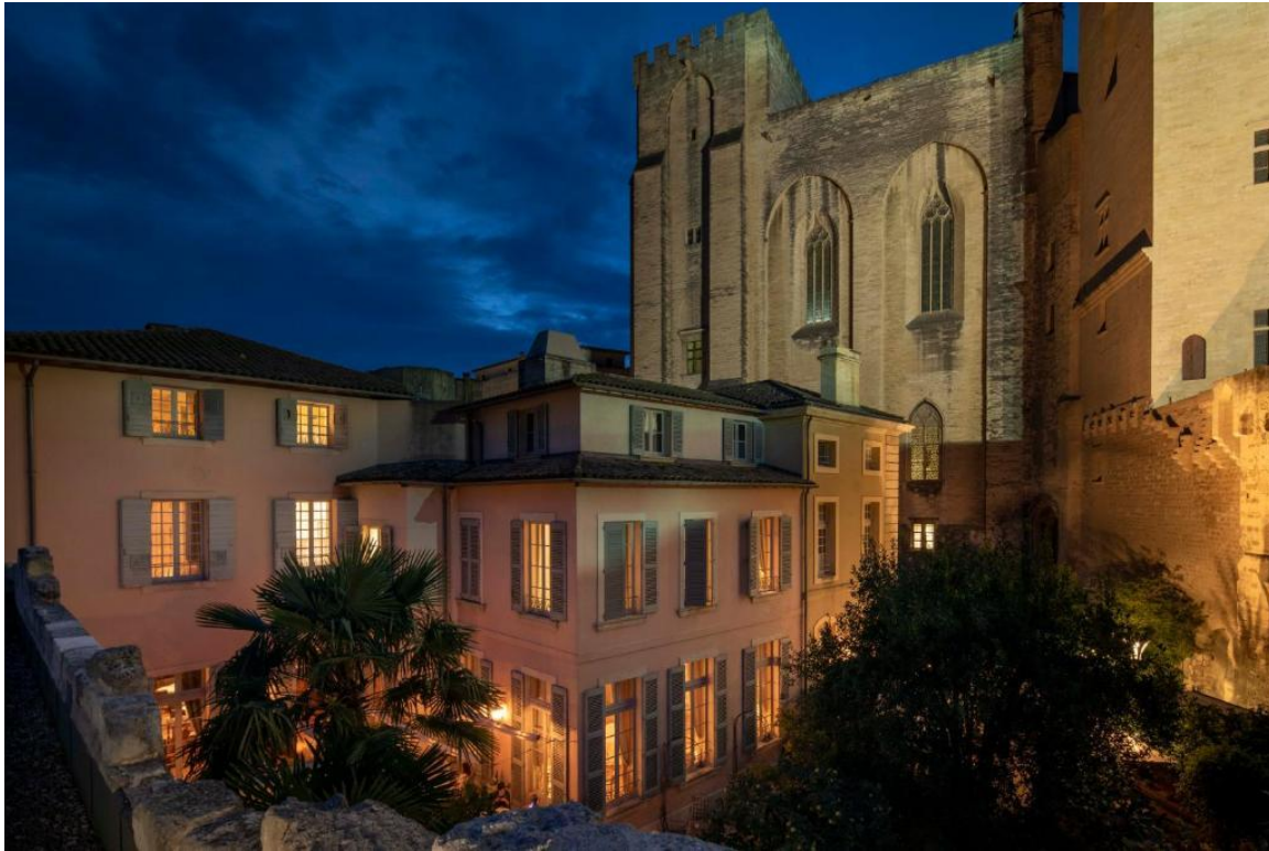
Hotel: La Mirande – 5-star Luxury Hotel

Paul-de-Mausole: the asylum that Vincent Van Gogh called home the last year of his life. We will visit the asylum, and then return to Saint-Rémy where, depending on the day of week and the season, we will taste some of the region's prized olive oil.