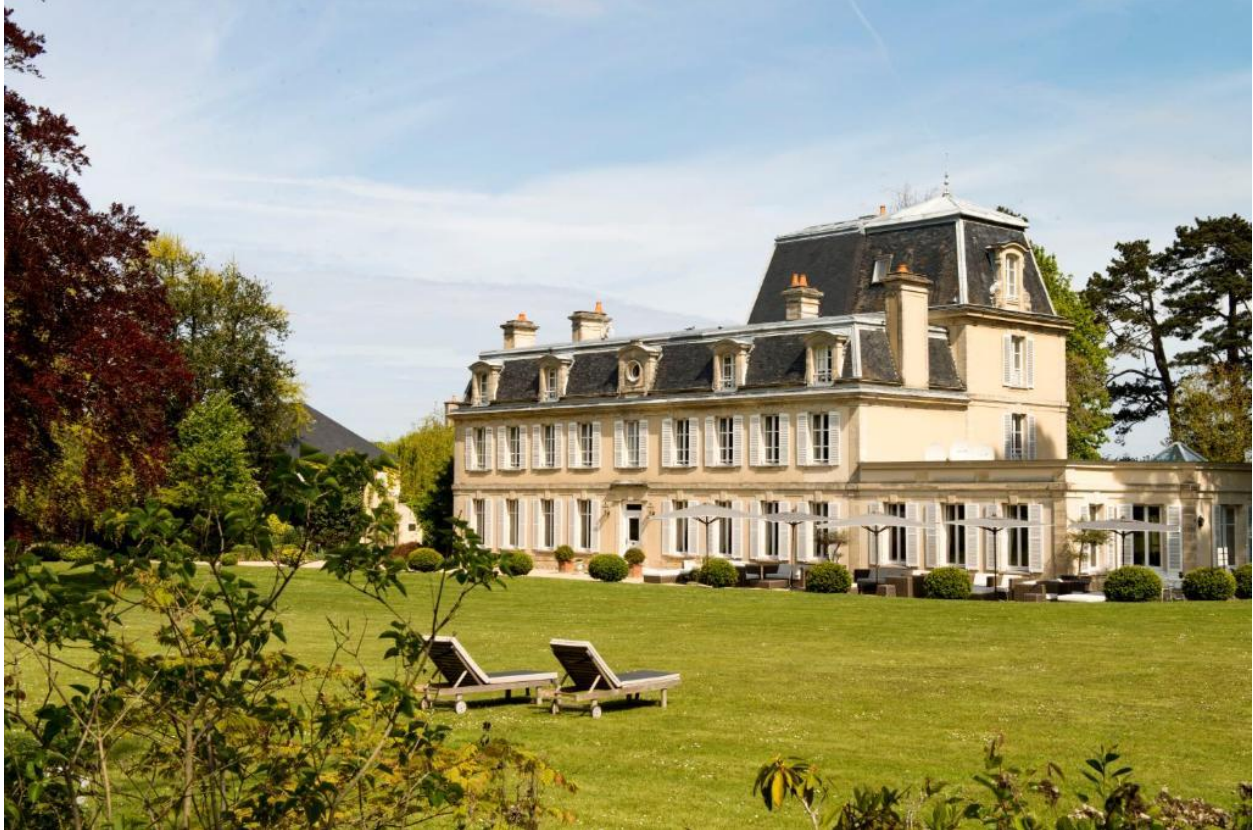
Hotel : Chateau La Cheneviere – 5-star Luxury Hotel