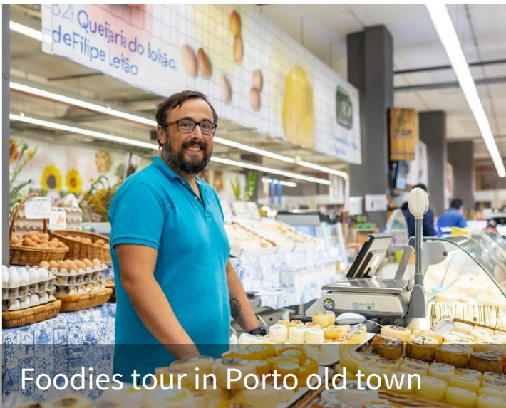
Foodies tour in Porto old town